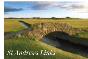
St Andrews Links