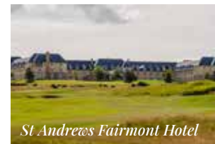
St Andrews Fairmont Hotel